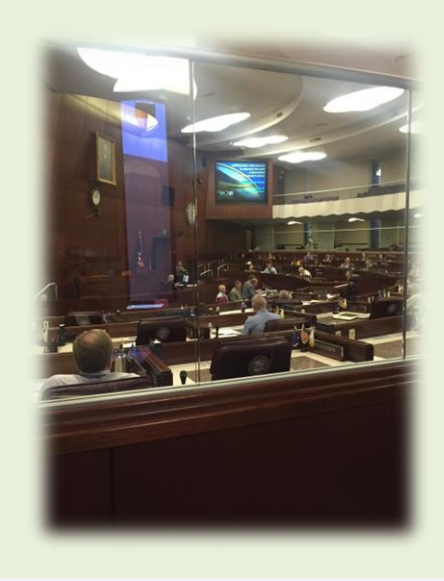
Nevada Drought Summit Meeting – Carson City September 2015